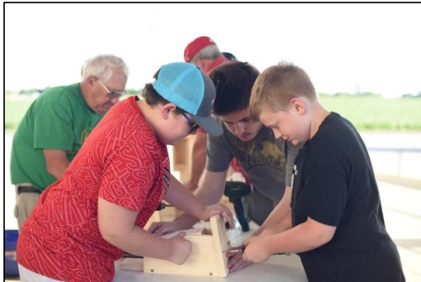
ABOVE: The children made birdhouses as one of the crafts. The kids enjoyed using the drill and painting them.