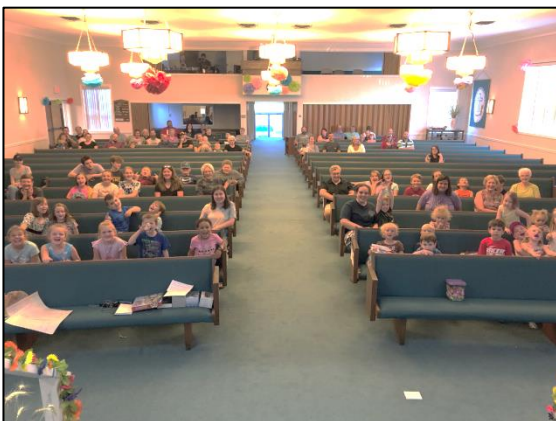
BELOW: A picture of all the children and their parents (in the back) on the last evening. Staff, volunteers, children, and parents all enjoyed ice cream sundaes after the closing worship.