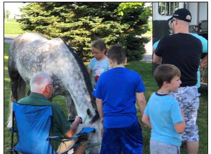
ABOVE: Children enjoyed petting and learning about live animals this year. They enjoyed interacting with a horse, calf, chicken, cat, dog, and goats.