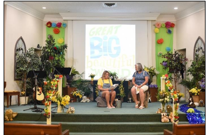
ABOVE: Children learned each day's Bible lesson through a drama played out on a beautifully decorated garden on the stage.